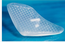
Conform™ Mandibular Angle

Contact Implantech for more about our innovative selection of nasal implants.