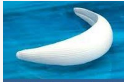
Solid ePTFE Implants

To get invaluable, expert instruction for placing chin implants, just attend our Las Vegas Masters Educational Series workshop in June or November.