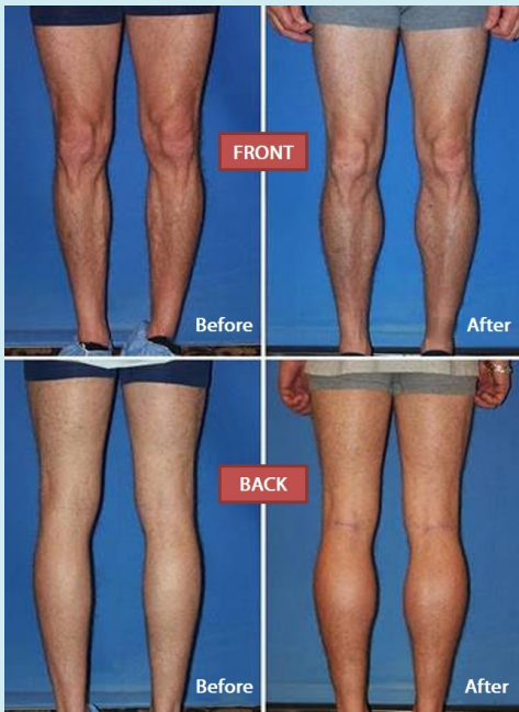
Male patient with calf implants